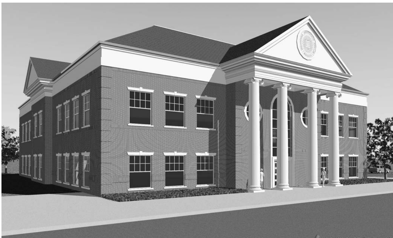
Rendering of the new IU South Bend Elkhart Center opening fall 2007 at 125 East Franklin Street, Elkhart.

INTERNET ADDRESS: www.iusb.edu/~extendsb